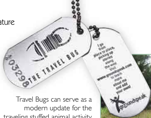
Travel Bugs can serve as a modern update for the traveling stuffed animal activity.